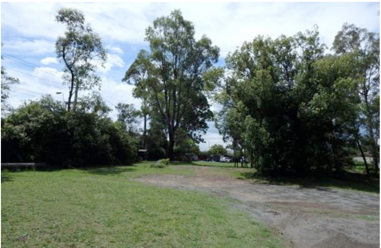
Photo 8 The site of a previous dwelling in the northern part of the subject site