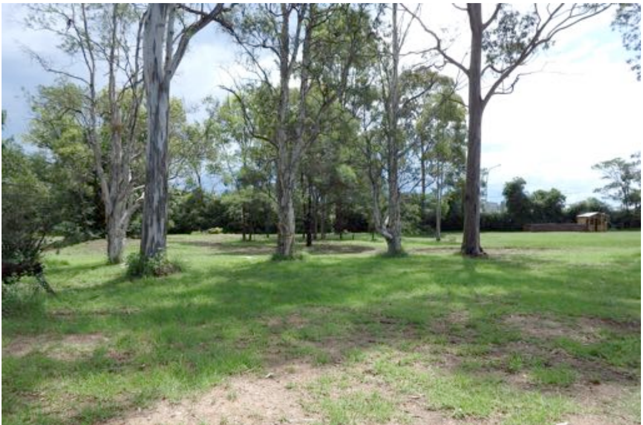
Photo 2 Scattered tree canopy over introduced mown grassland in the northern part of the site