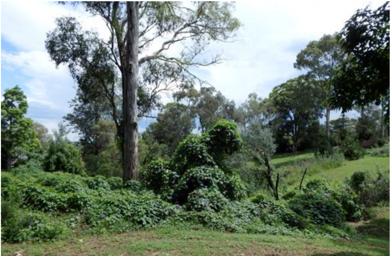
Photo 4 Dense weeds and mown grass in the drainage swale in the southern part of the site, with scattered remnant and planted trees