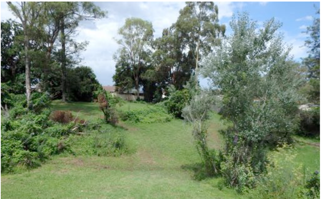
Photo 6 Looking east across the drainage swale in the southern part of the subject site – with mown introduced grassland, patches of weeds, horticultural plantings and scattered trees