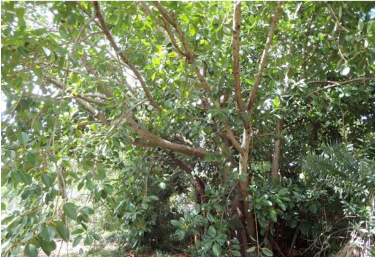
Photo 7 Very large Rubber Plant (a weed) near the eastern side of the subject site