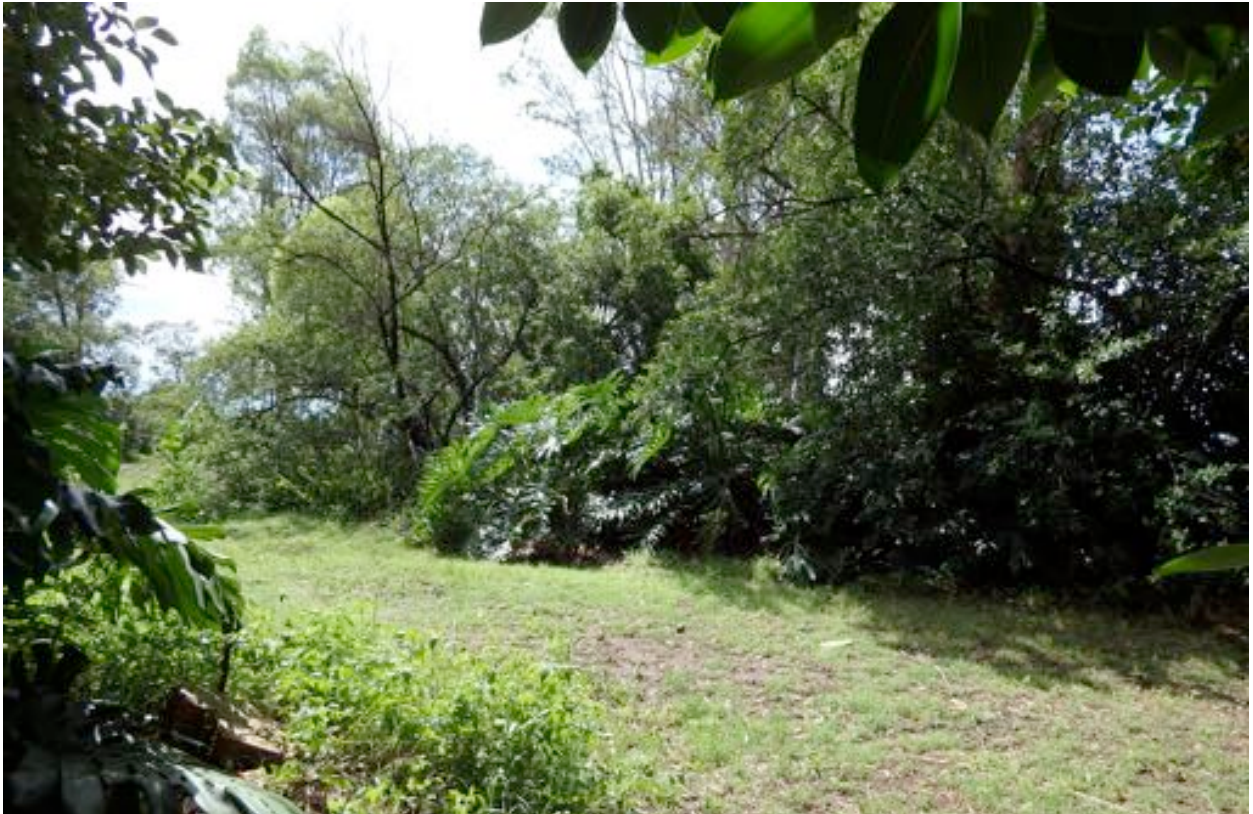
Photo 3 Dense weeds and horticultural plantings in the central parts of the subject site