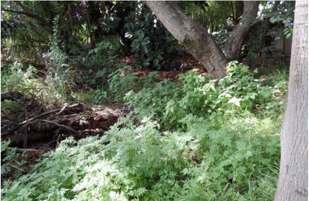
Photo 5 Dense weeds along the eastern boundary near the drainage swale