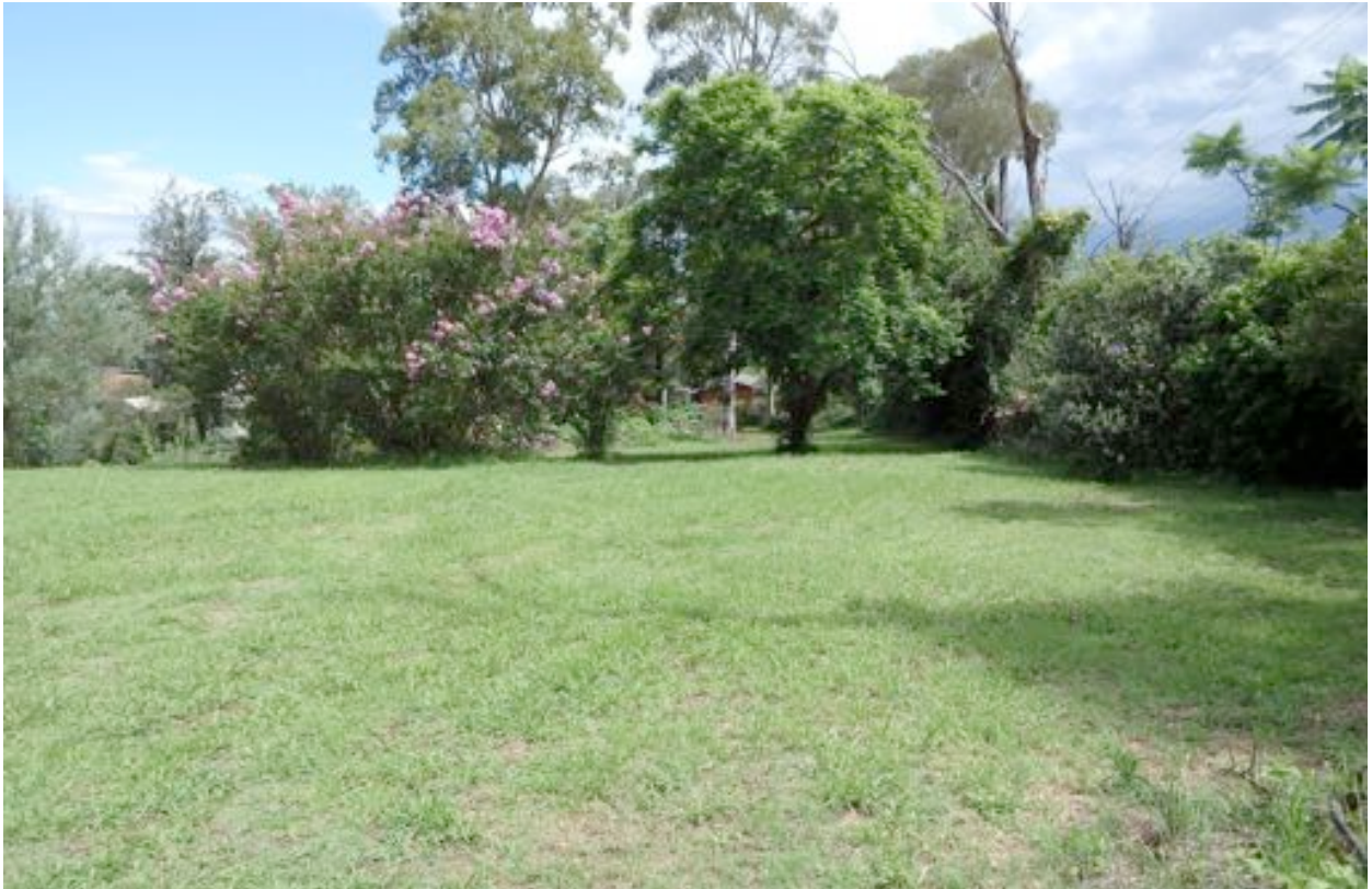
Photo 1 Typical view of the northern and central parts of the subject site – with planted shrubs and mown introduced grass